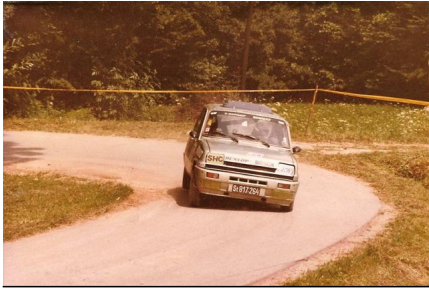
Sitzprobe RALT F3